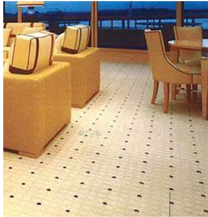
2 tone veneered elements - allows use of some existing elements