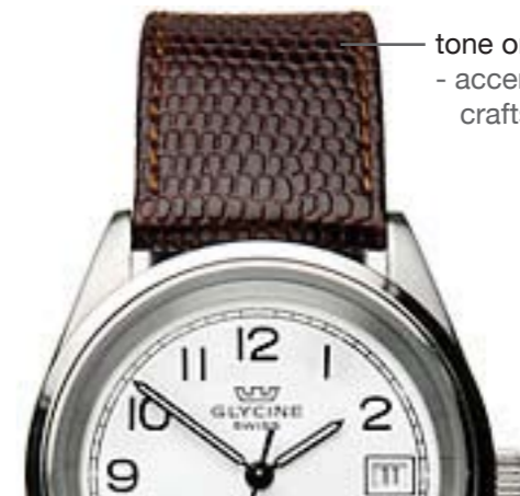
tone on tone stitch detailing - accents details & craftsmanship