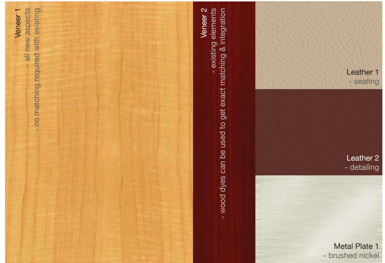
Veneer 1 - all new aspects - no matching required with existing