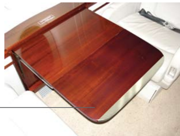
Standard single veneer finish - metallic inlays