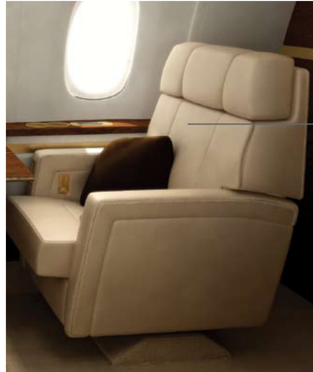
Decrane seat style Model A - adjustable head rest - full movement, rotation etc - full recline