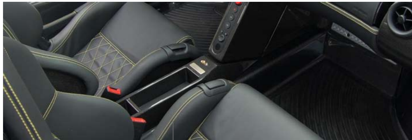
avant garde detailing