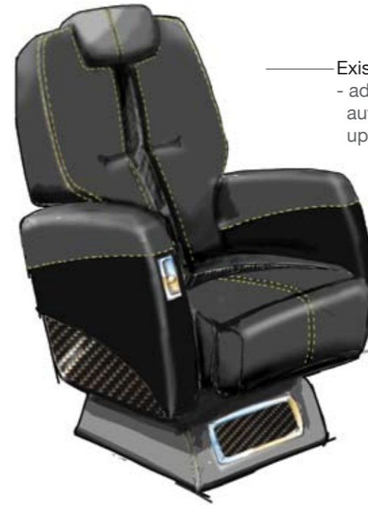
Existing AMP seat - additional custom automotive styled upholstery