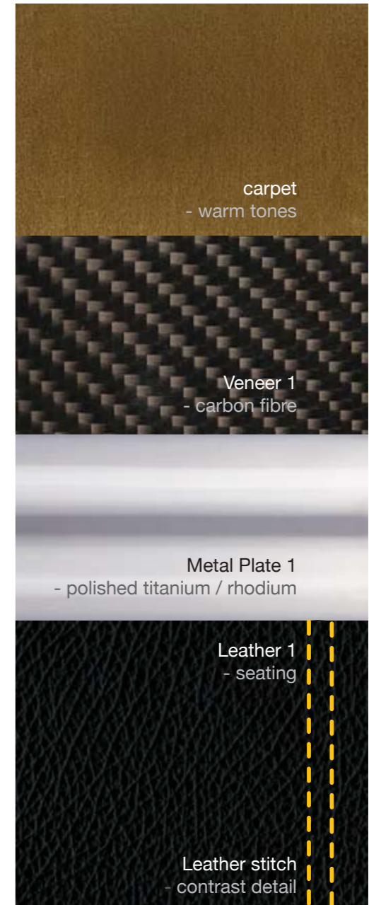
carpet - warm tones