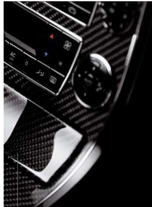
audacious materials - mix of surface finishes - subtle contrast in details